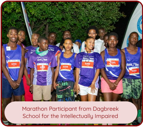
Marathon Participant from Dagbreek School for the Intellectually Impaired