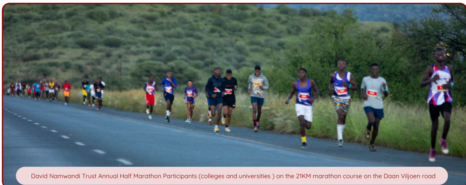
David Namwandi Trust Annual Half Marathon Participants (colleges and universities ) on the 21KM marathon course on the Daan Viljoen road