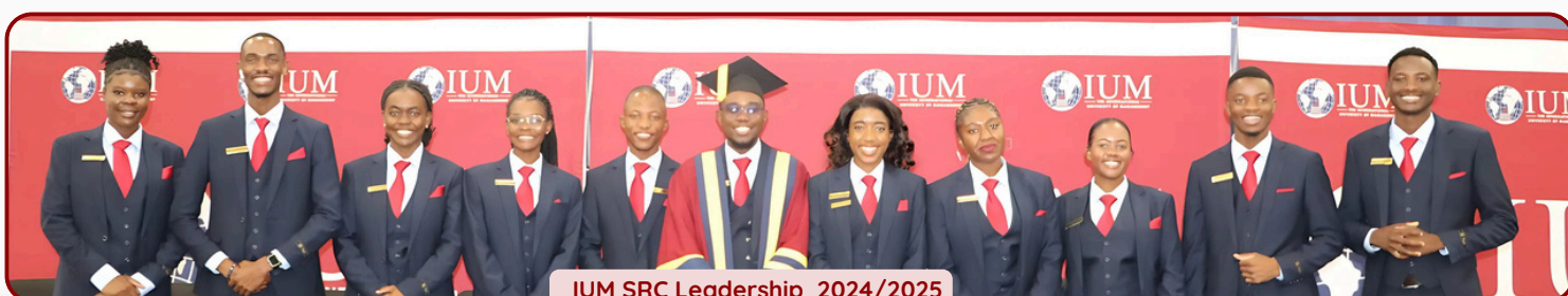
IUM SRC Leadership 2024/2025

As the SRC president and the SRC leadership embraced the theme “Celebrating Impactful Achievements,” he equally pledged that he will not neglect the girl child. He believes that every student at IUM regardless of gender, deserves an equal opportunity to succeed and that it is a collective responsibility to ensure that all students are given the tools to succeed.