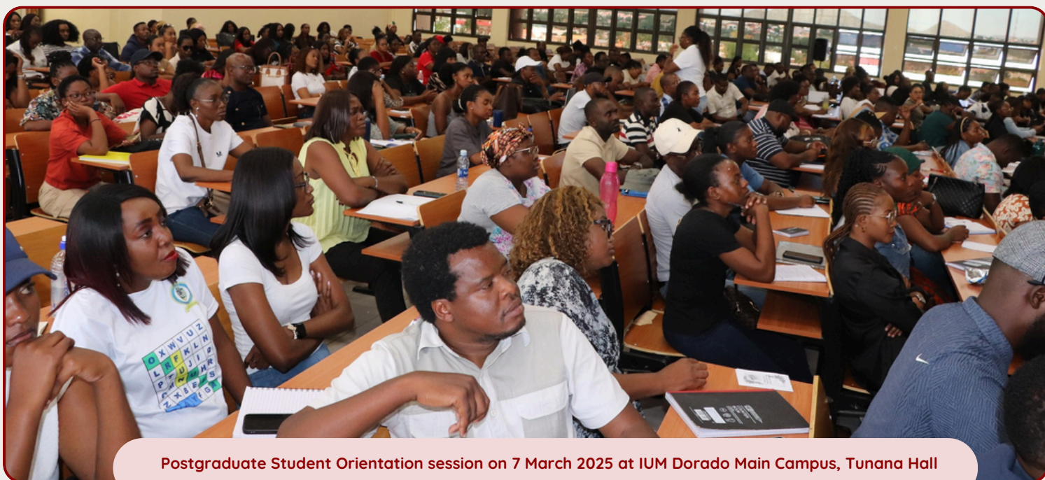
Postgraduate Student Orientation session on 7 March 2025 at IUM Dorado Main Campus, Tunana Hall

During the "Postgraduate Student Orientation" session, students were advised to be disciplined in their studies, forget about procrastination and focus on academic success. The essence was to kickstart the academic year with positive energy, and for the postgraduates to embrace an academic culture full of accomplishment and purpose.