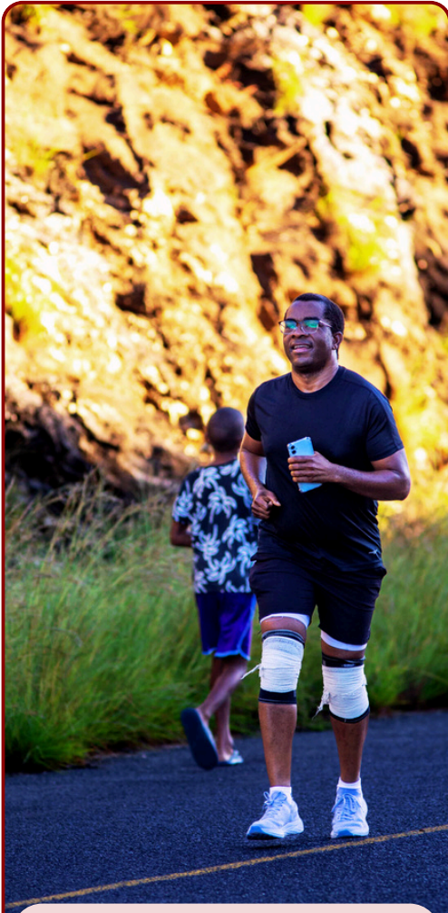
Bishop Lukas Katenda of the Reformed Evangelical Anglican Church of Namibia