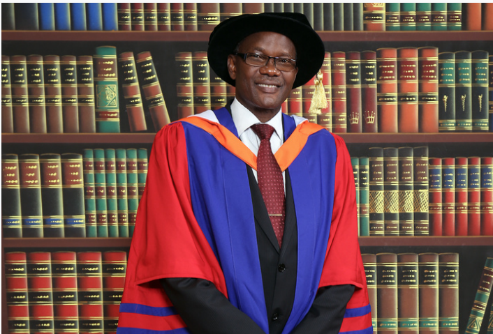
Hon. Prof. David R. Namwandi IUM Founder and Chairperson of the IUM Governing Council